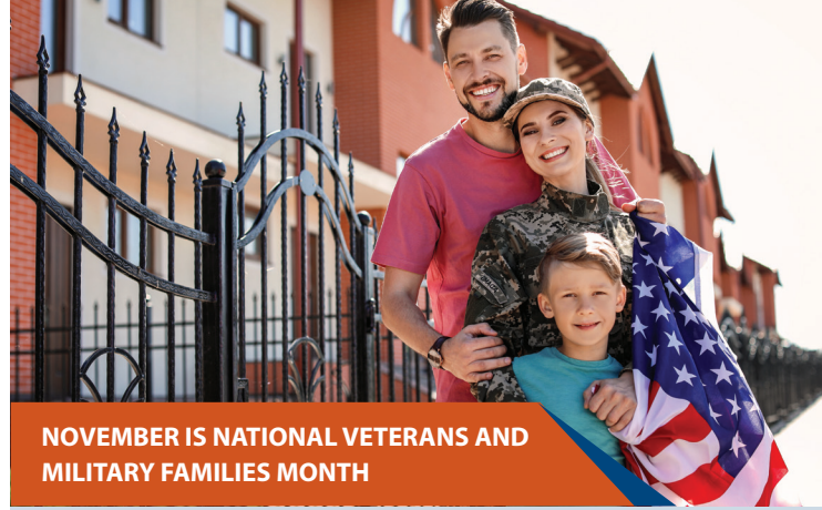
NOVEMBER IS NATIONAL VETERANS AND MILITARY FAMILIES MONTH

We are having a TikTok contest from November 1st to November 17th. Give us your best Turkey call for the chance to win 2 tickets to Disney. Post it to the comments of our Facebook post, and the post with the most 'likes' wins! This event is for current residents only.