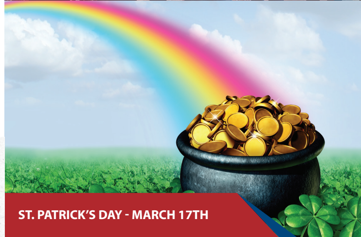
ST. PATRICK'S DAY - MARCH 17TH