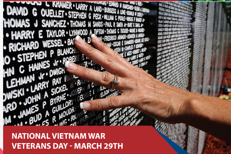
NATIONAL VIETNAM WAR VETERANS DAY - MARCH 29TH