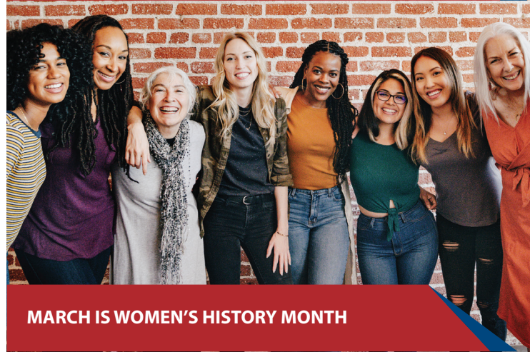
MARCH IS WOMEN'S HISTORY MONTH