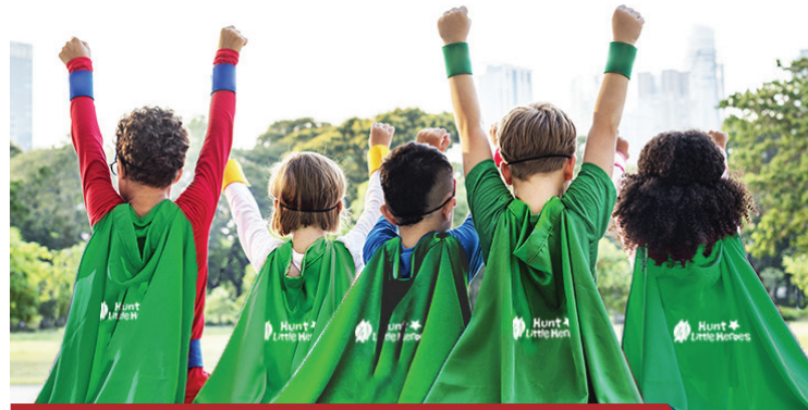
SHARE YOUR STORY STARTING MARCH 15TH - ENTIRE THE HUNT LITTLE HEROES CONTEST